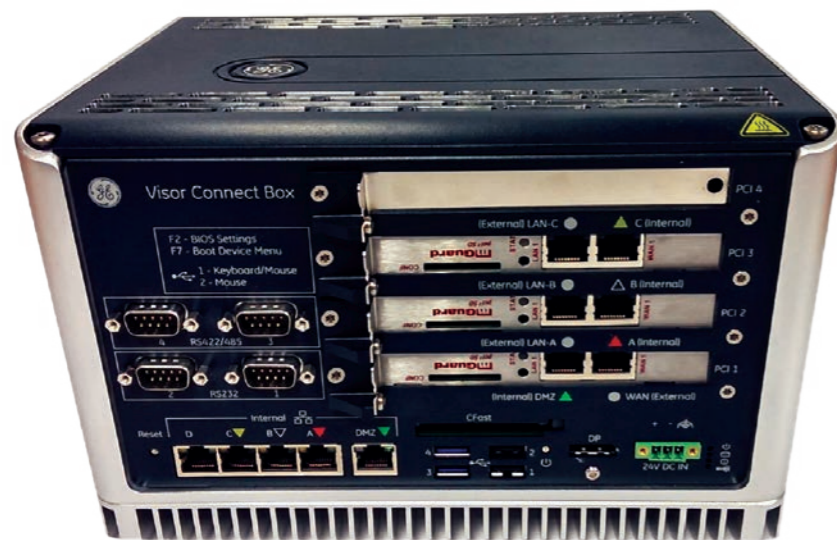
VISOR CONNECT BOX (VCB)