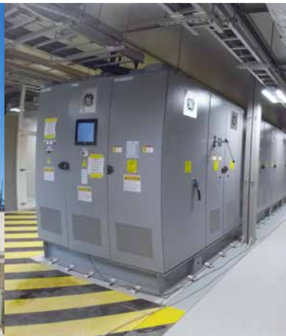
Inside an e-house