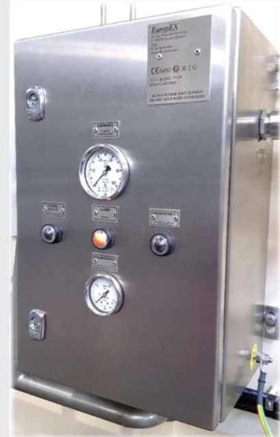
"Example of a purging unit setup on one of our newest ATEX certified motor"

GE's recommended inspection and component replacement schedule helps to reduce critical problems of purge systems, that may arise during the motor operation therefore maintaining system safety.